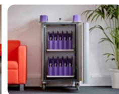
LapCabby Mini 20V