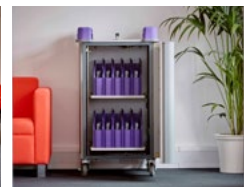
LapCabby Mini 20V